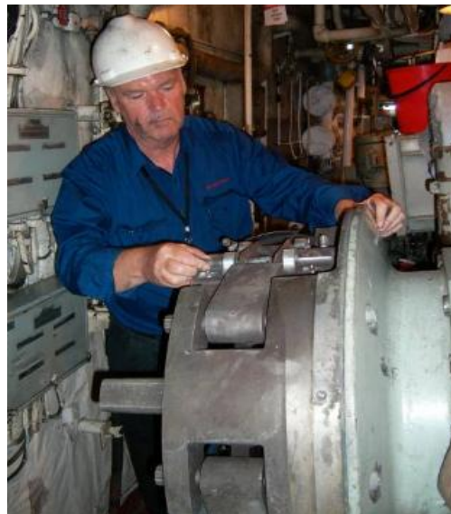
Propeller shaft brake inspection