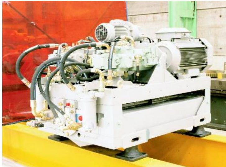
ANZAC Boat Crane – Hydraulic Power Pack – design, build, service, repair and support