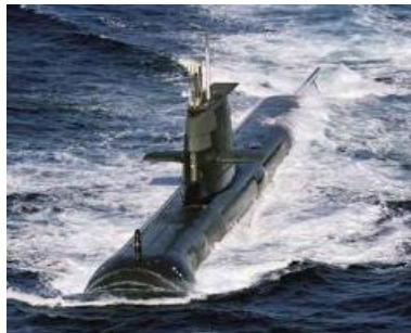
Customer ASC - submarine control plane shafts – build and repair