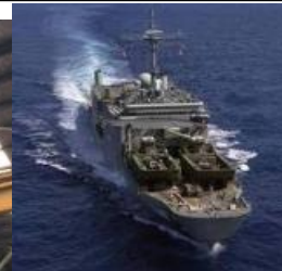
Landing Platform Amphibious Cranes – build, service and repair