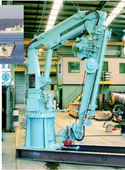
RAN Minehunter Crane – design, build, service and repair