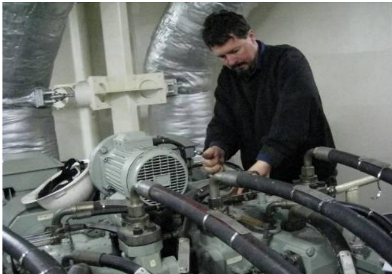
Servicing Hydraulic Power Unit