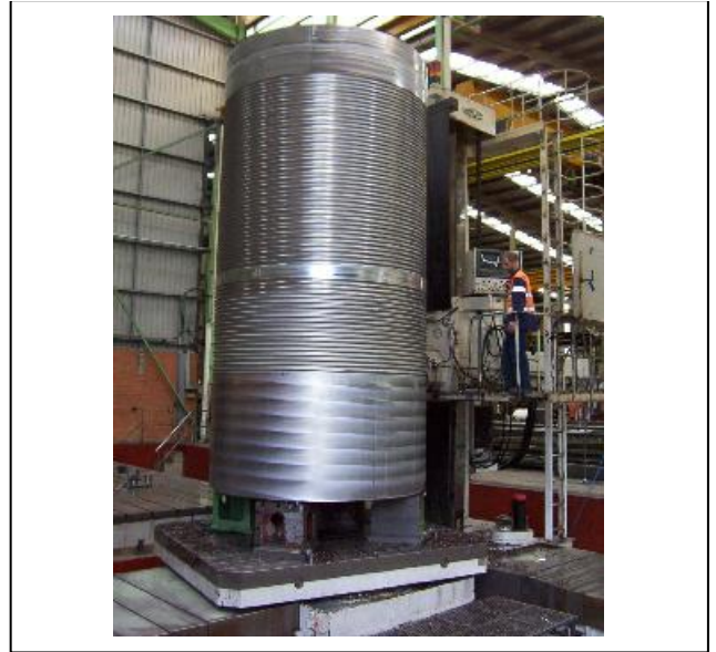
Heavy Machining Capability