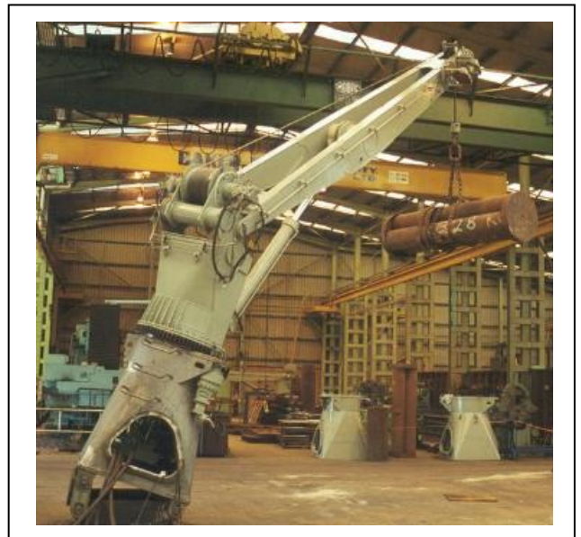
Design, build & test of mechanical, hydraulic & PLC Controlled equipment - ANZAC Boat Crane