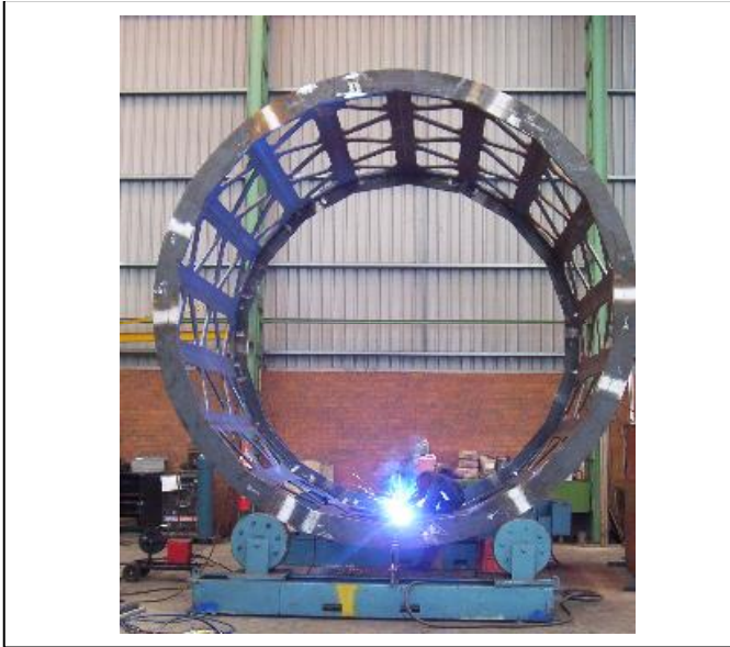
Fabrication of Heavy / Large Equipment