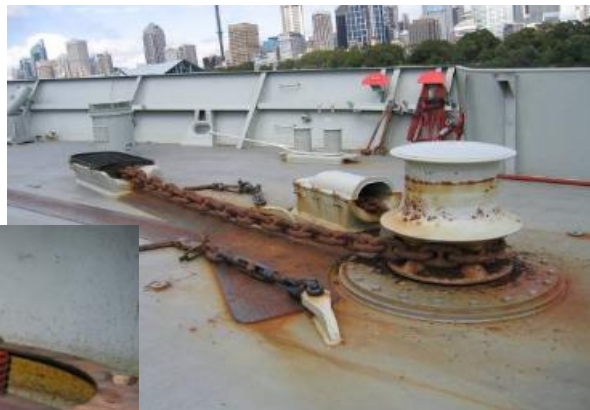
Winch service work on Ship