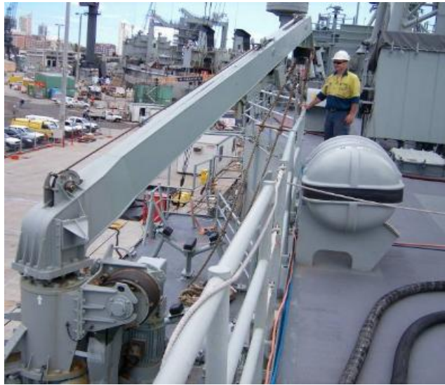
Onboard crane test