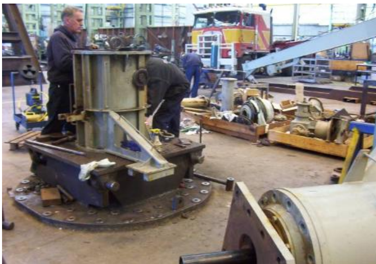
Workshop crane overhaul