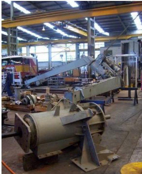
Workshop crane overhaul