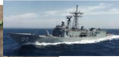
RAN Frigate Crane – build, service and repair