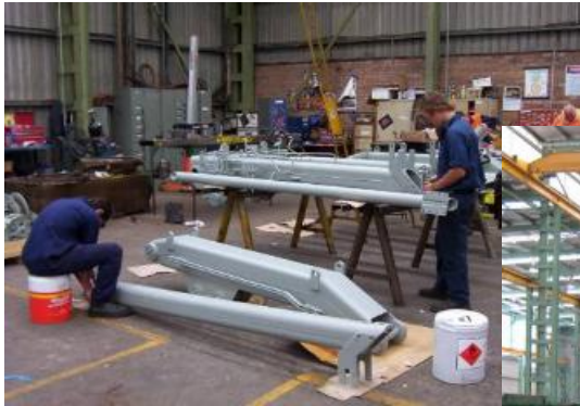
Navy crane stripped, overhauled and tested