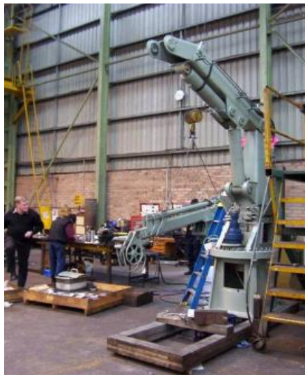
Crane overhaul in workshop