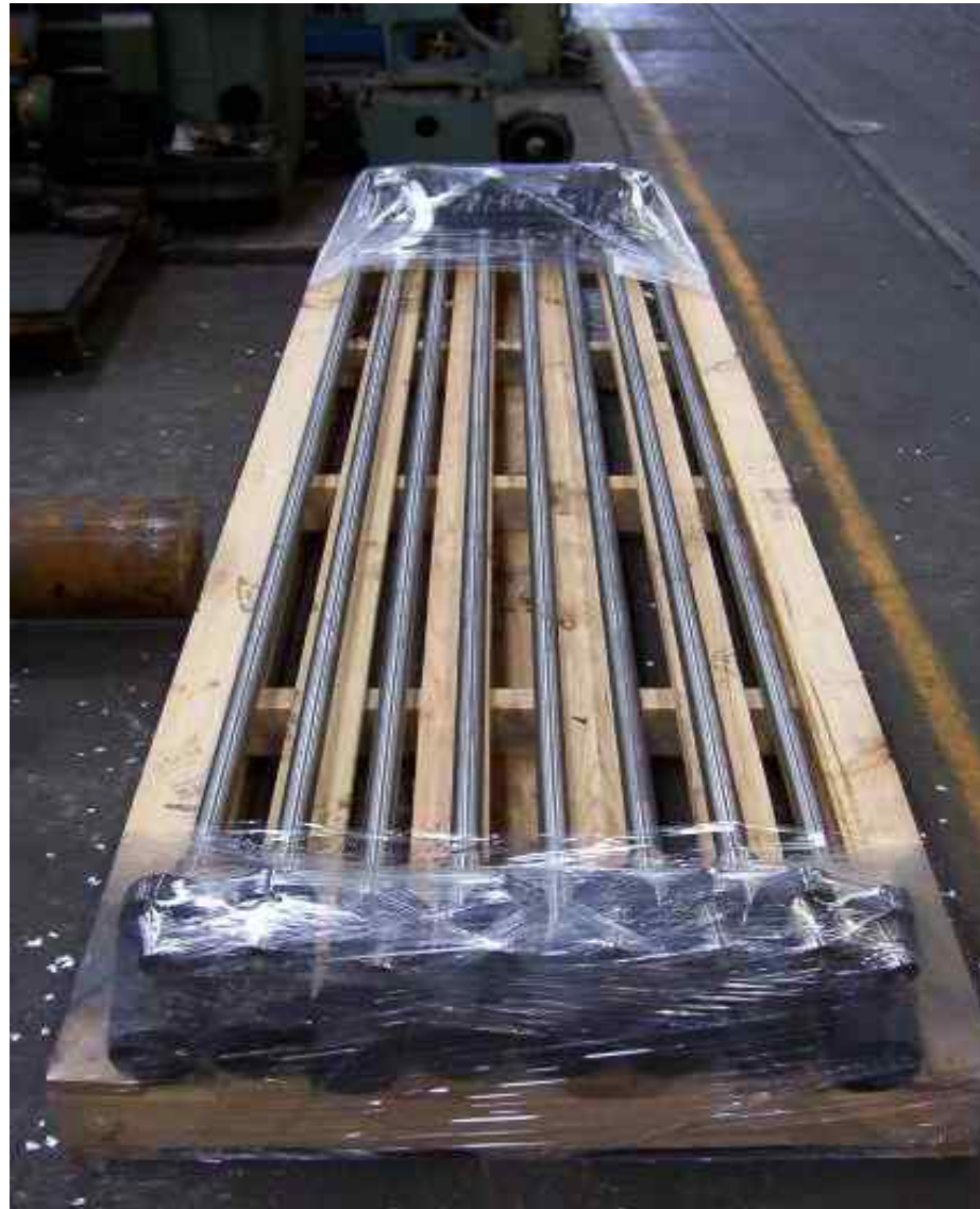
Torsion bars machined, assembled & packaged for delivery