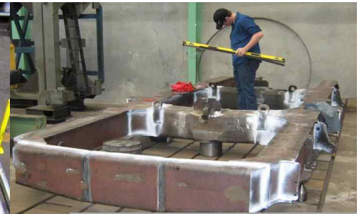
Checking Bogie Frame