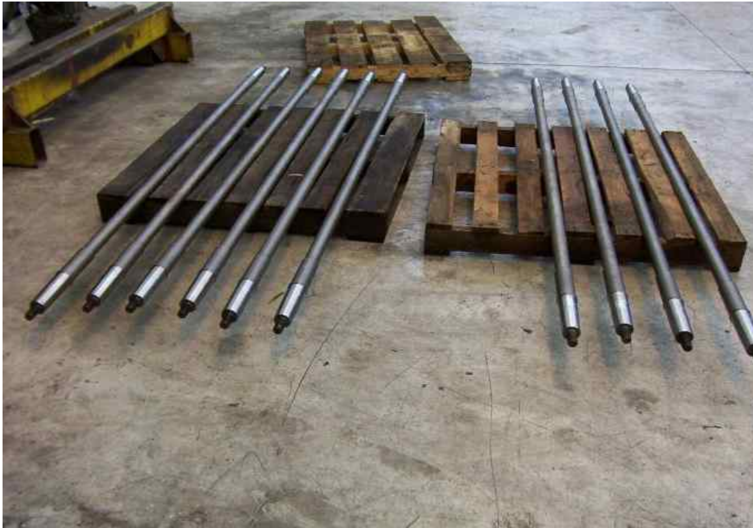
Torsion bars – European steel