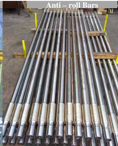
Anti - roll Bars