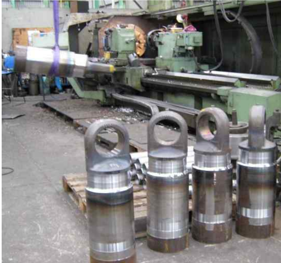
Couplers for weld & machine