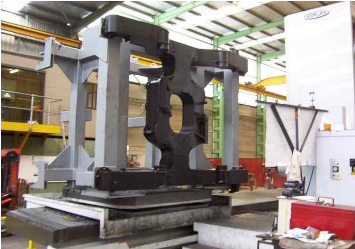
Bogie on 2 nd modern CNC horizontal borer