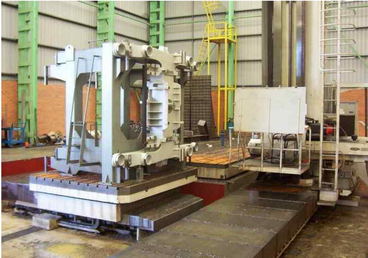
Millennium bogie machining on modern CNC floor borer